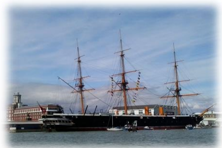
HMS Warrior, taken from the Harbour Tour boat