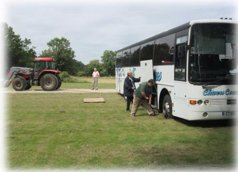
Tractor to the rescue!

He drove off the track onto the grass verge to do a three-point turn but he got firmly stuck in the soft ground – couldn't move forwards or backwards! He tried all sorts for the wheels to get a grip and