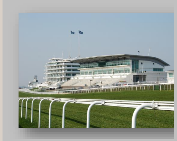
EPSOM RACE COURSE

General Meetings are held at Trinity Church Hall, Hill Road, Sutton, starting at 2.30pm.