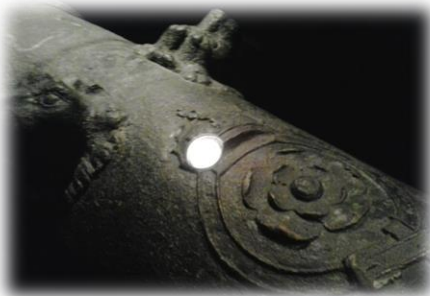
Part of the cannon recovered from the Mary Rose – detail shows the Tudor rose and a lion's head.