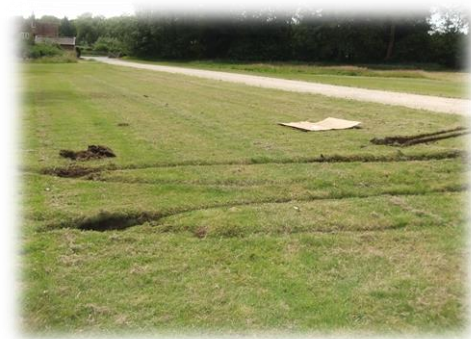
Ruts left by the coach!

We were slightly late, but thanks to the Loseley staff the day went beautifully.