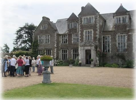
Congregating for the Tour

I think the problems of the morning added a fillip to the day, especially as they were so quickly and easily sorted out. The embarrassed driver apologised for his mistake before starting the journey home.