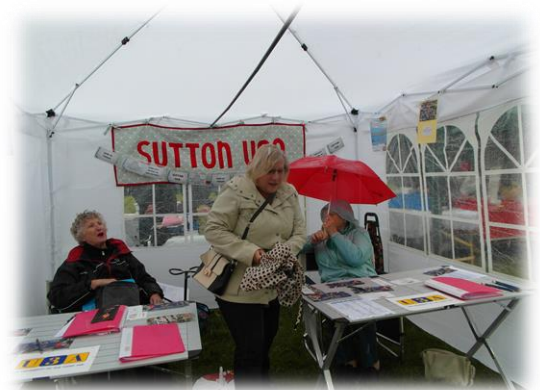
Smiling through the Rain at the Carshalton Environmental Fair!