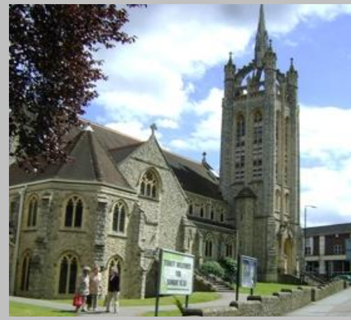
TRINITY CHURCH, SUTTON